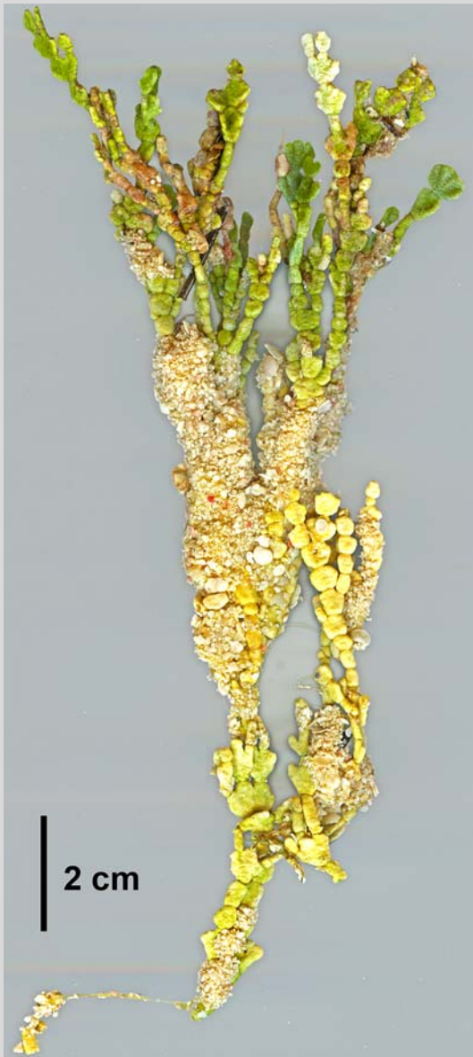
Fig. 3 Single thallus separated from Fig. 2 population showing rhizoidal proliferations binding sand along entire length of buried segments

Linton's Beach and Harbour Cottages, Harbor Branch Oceanographic Institution (HBOI Contribution No. 1670) and the Smithsonian Marine Station at Fort Pierce (SMS Contribution No. 689).