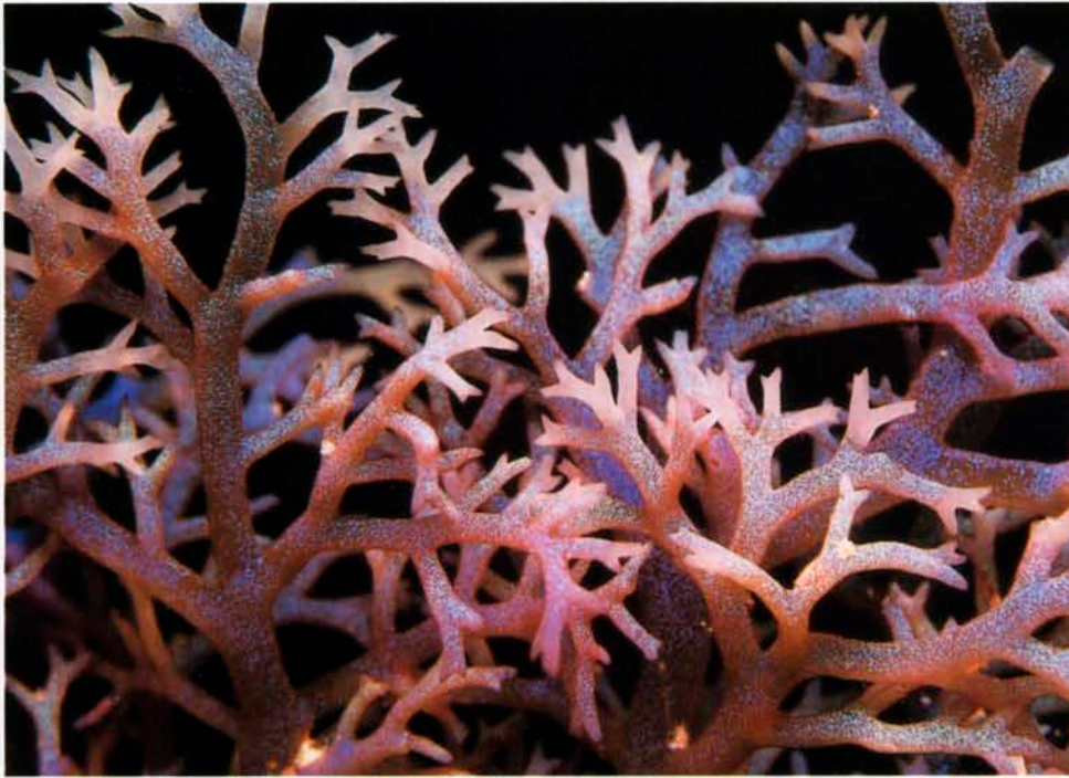
Ochtodes secundiramea , left, found just in front of the reef crest or on mangrove roots in pristine water, is usually small, bushy, and bright iridescent blue, purple, or red.